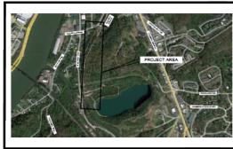
KNOXVILLE, TENNESSEE PROJECT LOCATION MAP

CITY OF KNOXVILLE, TENNESSEE HONORABLE INDYA KINCANNON, MAYOR CONSTRUCTION PLANS FOR FORT DICKERSON PARK SITE UTILITIES