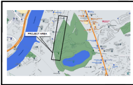
KNOXVILLE, TENNESSEE PROJECT VICINITY MAP